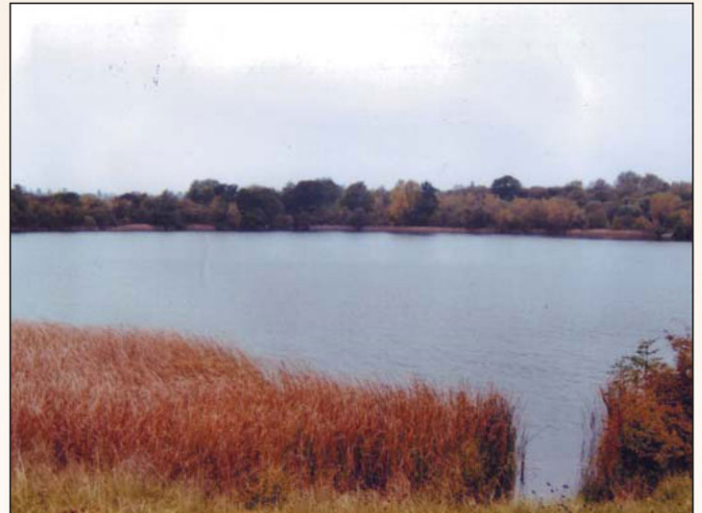
Blue Lagoon today