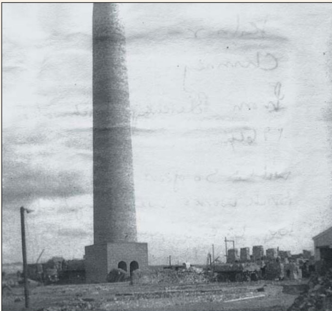
Chimney and furnace c.1964

In the early 1990s it was turned into a nature reserve with the only drawback being the southern pit which is now being used as a landfill site, showing Milton Keynes is a place of contradiction.